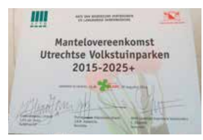
Protection of the allotments in Utrecht