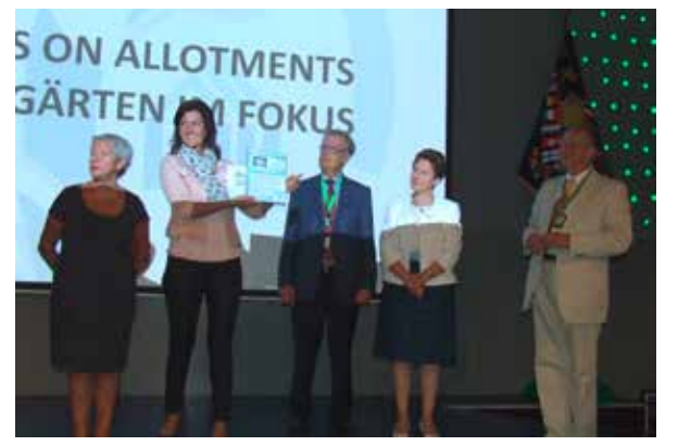
Remittance of the diplomas