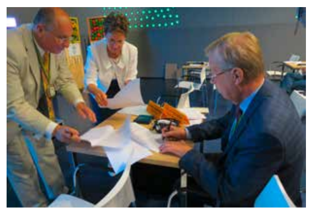
Signature of the resolution