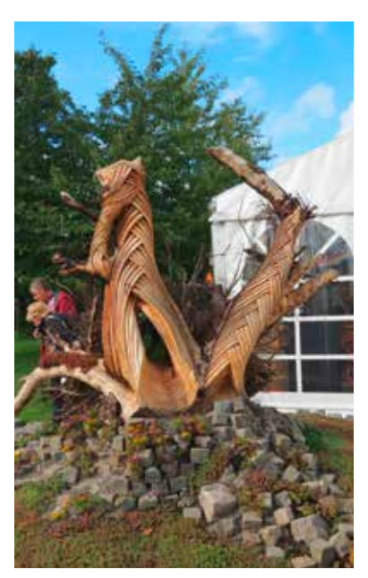
Statue as souvenir of the 37th international congress and the European Day of the Garden