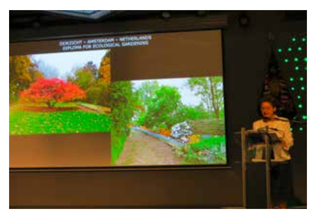
Remittance of the diplomas